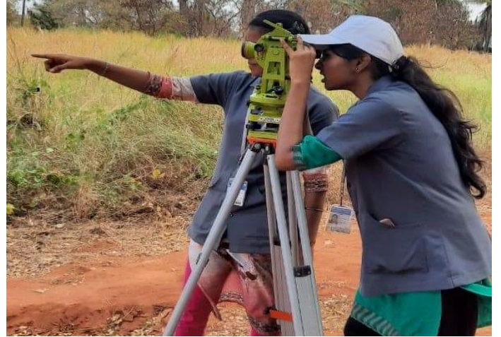
Survey Camp for Civil Engineering students of Sri Ramakrishna Polytechnic College, held at Sri Ramakrishna Institute of Technology on 06.02.2020.